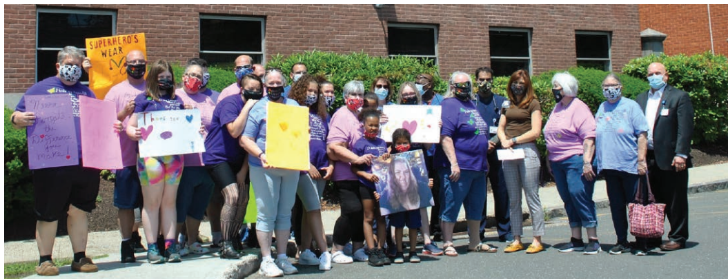
Grateful family presents gifts and thanks to Saint Mary’s Hospital colleagues.

Although devastated by their loss, the family was profoundly touched by the exceptional and compassionate care she received at Saint Mary’s Hospital. They spoke of how grateful they were to receive thorough updates every day from the doctors and nurses. During a celebration of life service for their loved one, the family accepted donations in her memory. The family came to Saint Mary’s to personally thank the colleagues and present them with gifts.