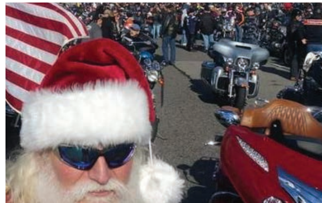
Mercy Medical Center – Hope for the Holidays Toy Run