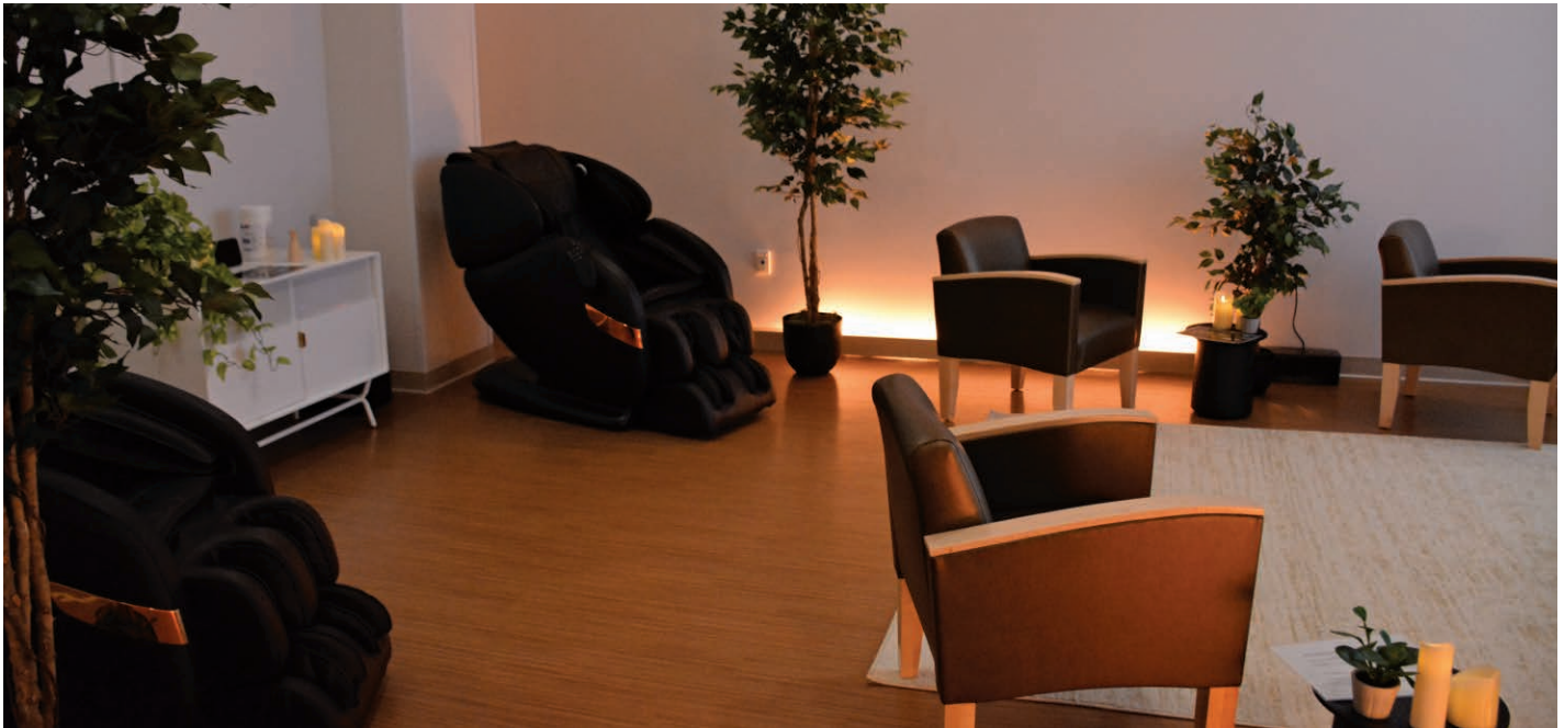
The Zen Room at Mercy Medical Center will serve as a "recharge room" for colleagues.