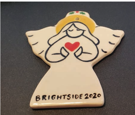
Mercy Medical Center – 2020 Brightside Angel Ornaments