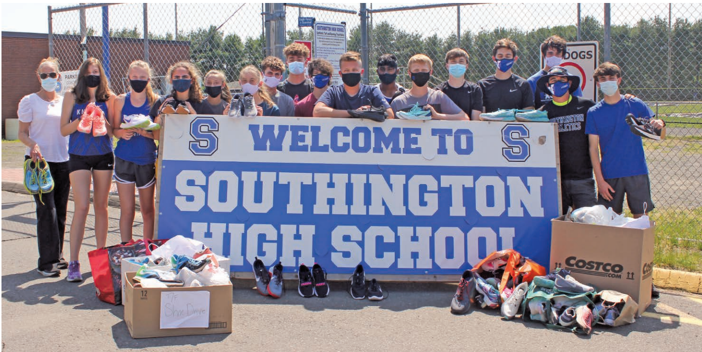
The Southington High School Track Team with the more than 60 pairs of sneakers they collected during their drive.