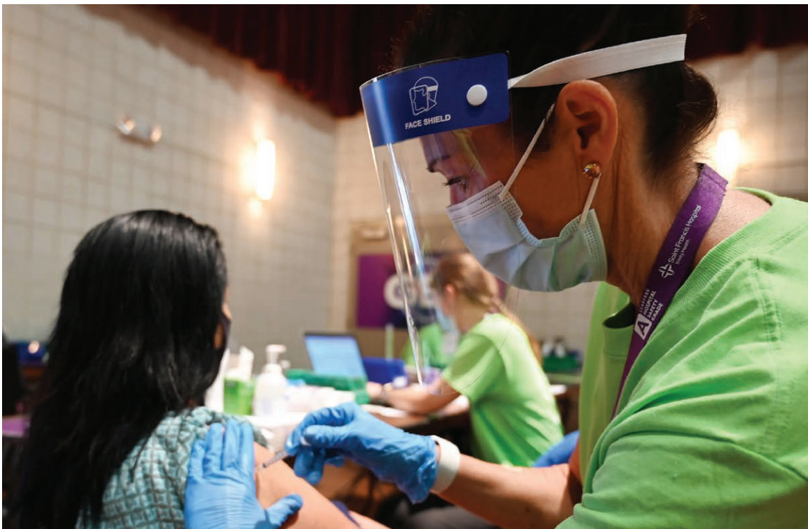
An estimated 3,000 individuals received a COVID-19 vaccination during the region’s only 24-hour Vax-A-Thon. The Vax-A-Thon was held at The Artists Collective, 1200 Albany Avenue, Hartford, CT.