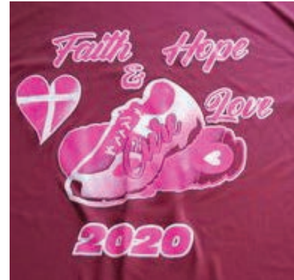
Saint Francis Hospital – Beat Breast Cancer Walk & Run