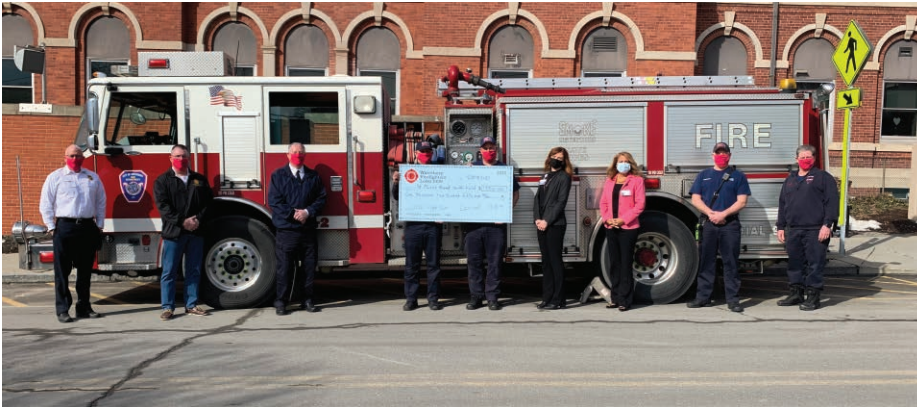
Saint Mary's Hospital – Pink Out

Third-Party Events are fundraisers hosted by grateful family members and friends whose event proceeds benefit a specific area of care most meaningful to them. During the pandemic, many hosts had to make the difficult decision to cancel their events. However, some were able to find different ways to engage their community in an effort to continue to raise funds for the hospital they care about most. These events raised almost $60,000 for our hospitals and included many gift-in-kind donations of blankets, stuffed animals, care baskets for nurses and much more. The 2022 calendar of events is starting to fill up as we move further away from the height of the COVID-19 pandemic. For information on how you can host an event or participate in one, please visit our philanthropy websites: mercygives.org ; saintfrancisdonor.com ; and stmhfoundation.org .