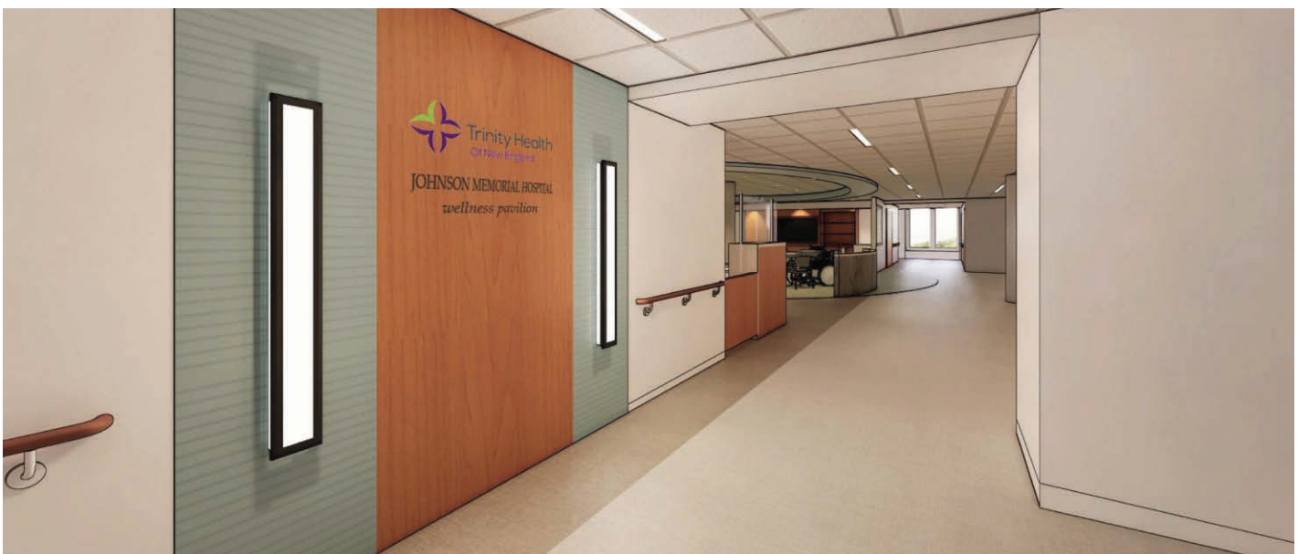
Rendering of the Geriatric Wellness Pavilion