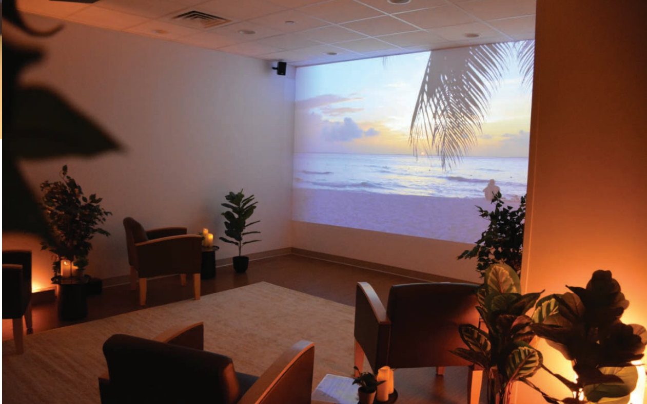
(at right) Tranquility Room at Mercy Medical Center