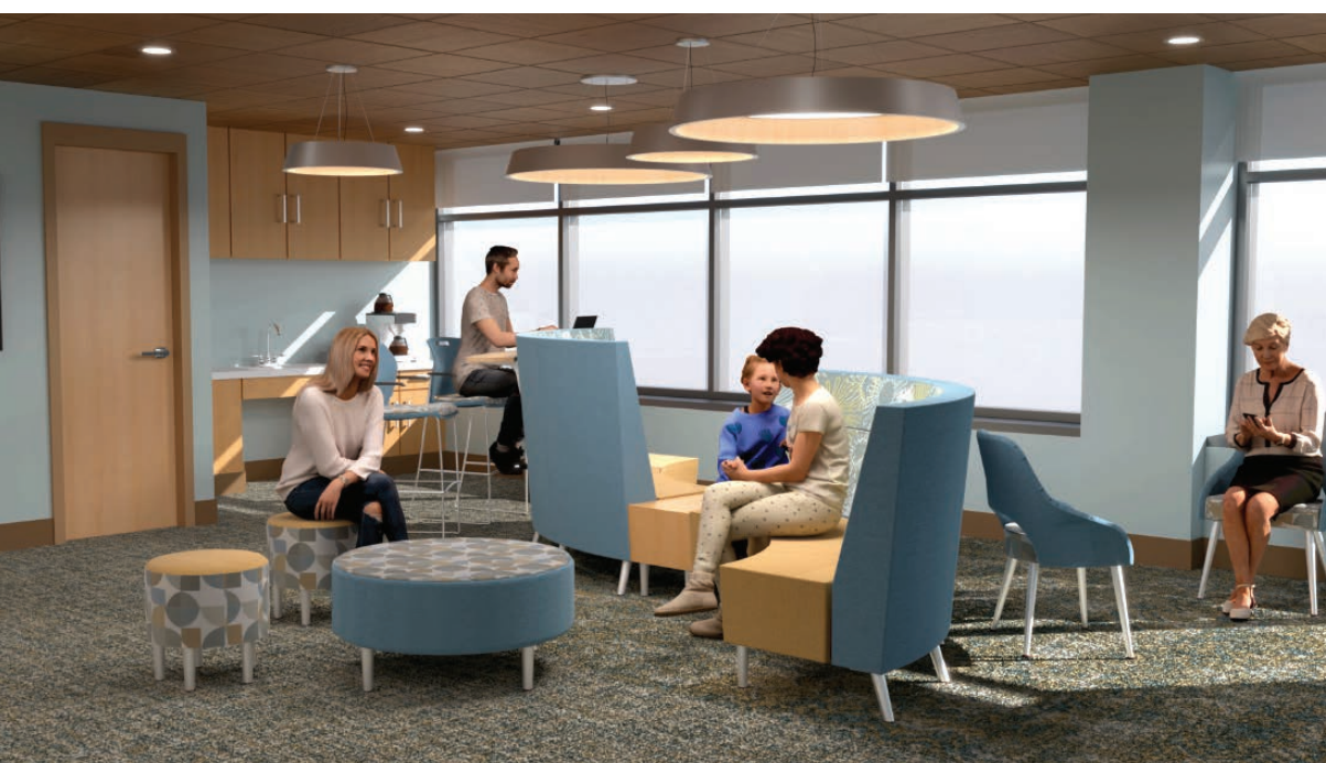
Rendering of the Governor Charlie Baker and Lt. Governor Karyn Polito Family Comfort Lounge